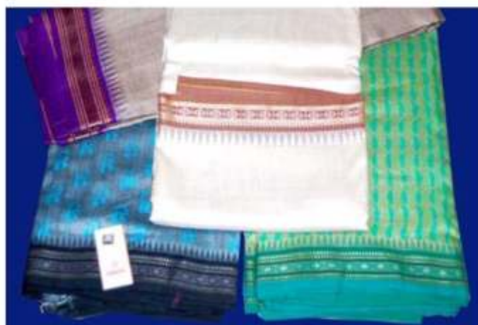
Ladies Silk Wear

History of the Company: From last 16 Years working in rural and tribal area for developing silk cocoons and weaving of silk fabrics, converting them into different designs and different patterns like dress material, sarees, interiors, etc.