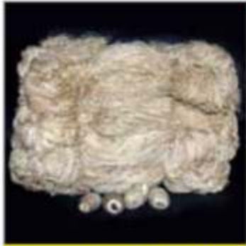
Tassar Ghicha Silk Yarn