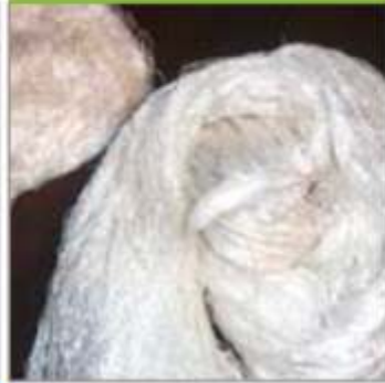
Dupion Silk Yarn

Recent Developments: Plantation of Mulberry Silk Caloons.