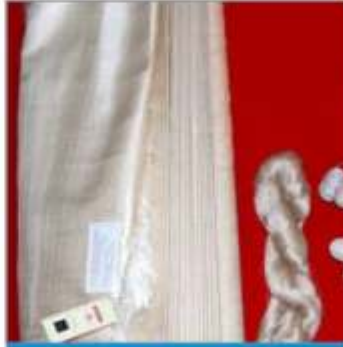
Tassar Silk Fabric