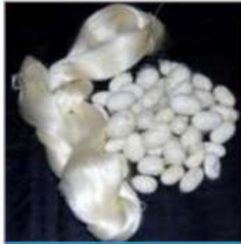
Mulberry Raw Silk Yarn