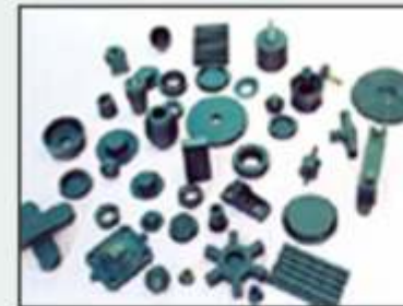
Rubber Moulded Items