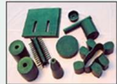
Skirt Block & Buffers

Mantras for Success: Diligent service, Personal Relations and Uncompromising Quality. With emphasis on client retention repeat business and long term partnership.