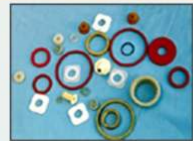
FG Neoprine Mould