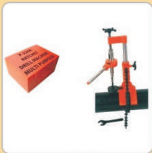
Ratchet Drill M.