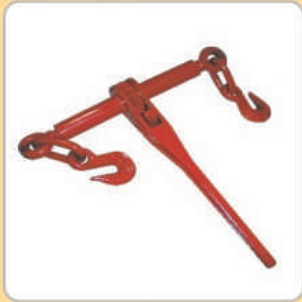
Ratchet Load B.