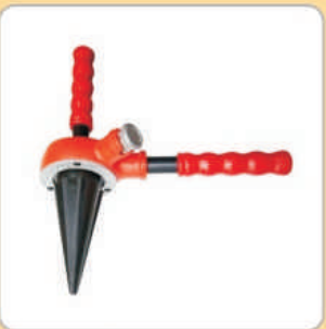
Ratchet Pipe R.