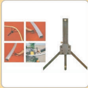
Bending Radius G.