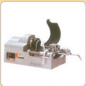
Asada Speedy Bolt