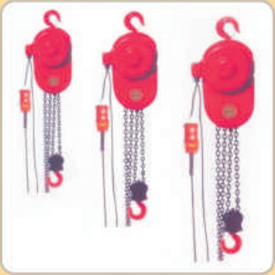
Endless Chain Electric B.