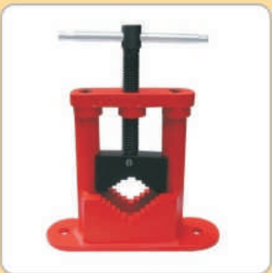
Pipe Vice P.