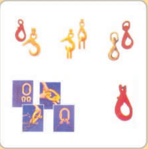
Self Locking Eye H.